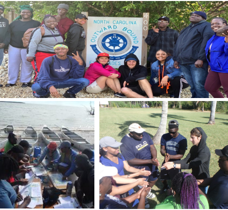
Seniors from Georgetown High School on Outward Bound Course